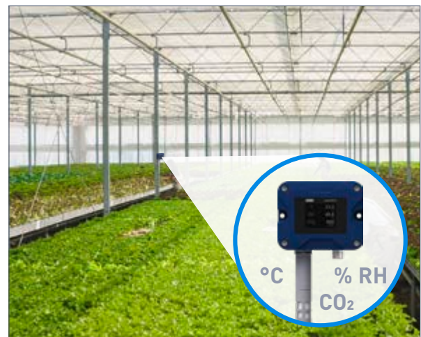
JUMO hydroTRANS S20 for temperature, humidity, and CO 2 measurement in the greenhouse